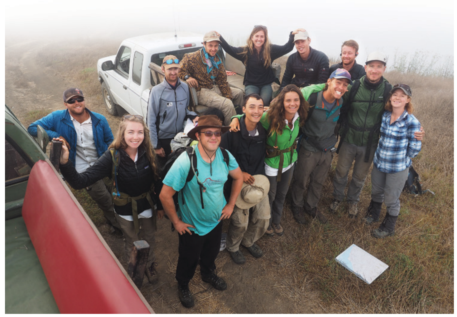
2017 Summer Field class in the middle of the main mapping area, at the head of Posa Canyon, on Santa Cruz Island. Santa Cruz Island provides students with a challenging environment in which to map a range of rock types and learn about Quaternary geology and active tectonics.

Overall, the group was very motivated and took to the challenge of mapping on Santa Cruz Island with enthusiasm. The group adapted well to using the new digital methods and was able to produce impressive professional geologic products.