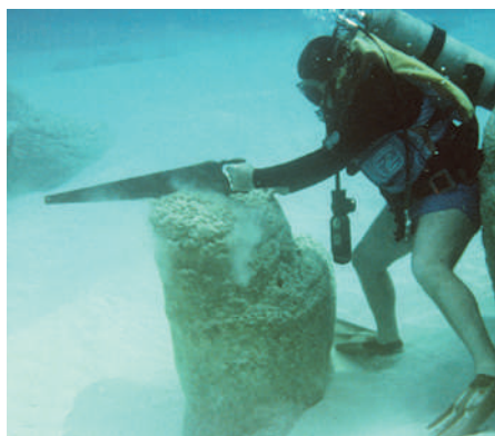
Figure 2 | Cutting through the complexities of stromatolites. Modern stromatolites — such as those shown here at Lee Stocking Island, Bahamas, as well as from places such as Shark Bay, Western Australia — provide essential comparisons for interpreting analogues from earlier in Earth's history.

of interspace areas: sediment in the interspace area has a vertical gradation in grain size, indicating the operation of mechanical processes, whereas grains in the laminae are not graded. Rather, these grains evidently accumulated on the steep slopes of the cones 8 , suggesting that there was some mechanism for trapping and binding them, like that found in microbially influenced sediment accretion. Allwood et al. 2 also point out that there are no known abiotic processes that could produce the facies-related stromatolites persistently and sometimes simultaneously on the carbonate platform.